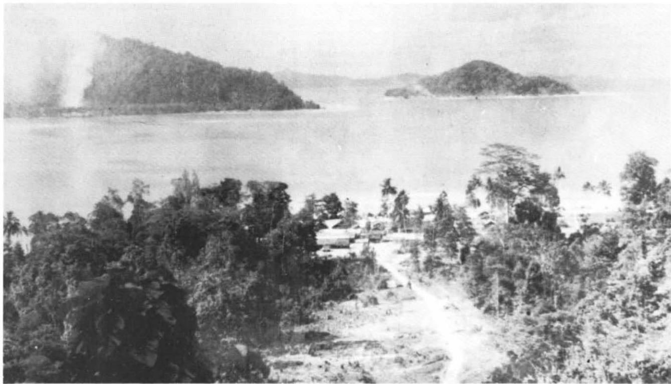
A view of Fauro Island with the main camp area at Central Bay. On the right background is the island where most of the Japanese were quartered. Each day they would arrive by barge, be allocated their duties and return in the evening to their own island camps. Fauro Island, the final base of 7 Bn before it dispersed to "civvies".