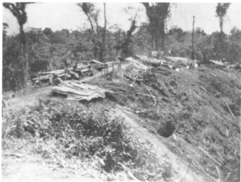
A further view of the Numa Numa Trail, with one of the permanent positions.