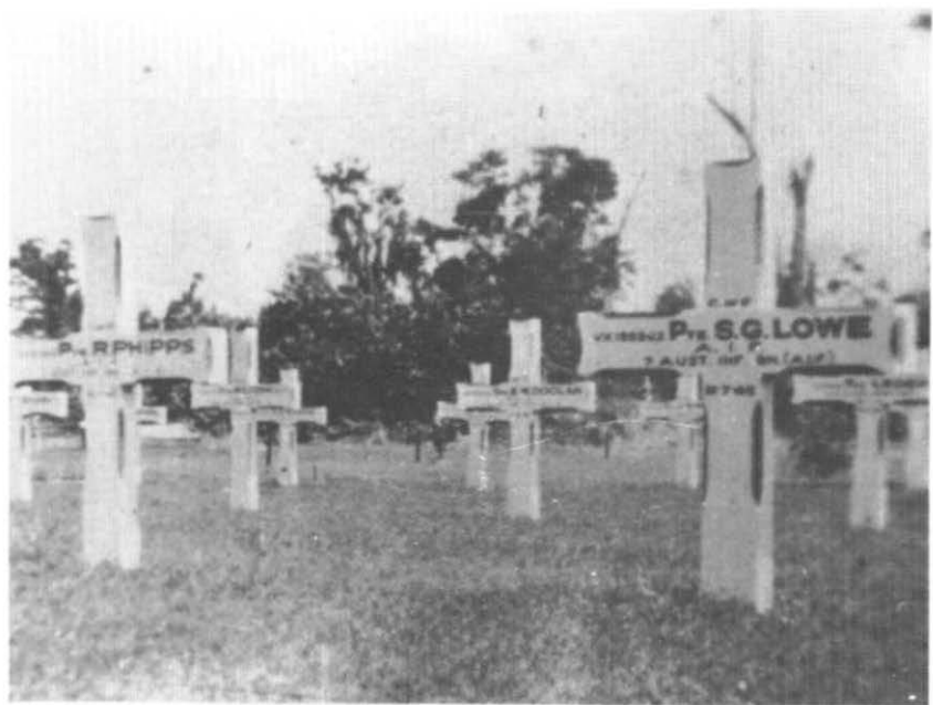
Graves of the 7th Battalion members when located at Torokina. P.R. Phipps and S.G. Lowe, both members of "B" Coy.