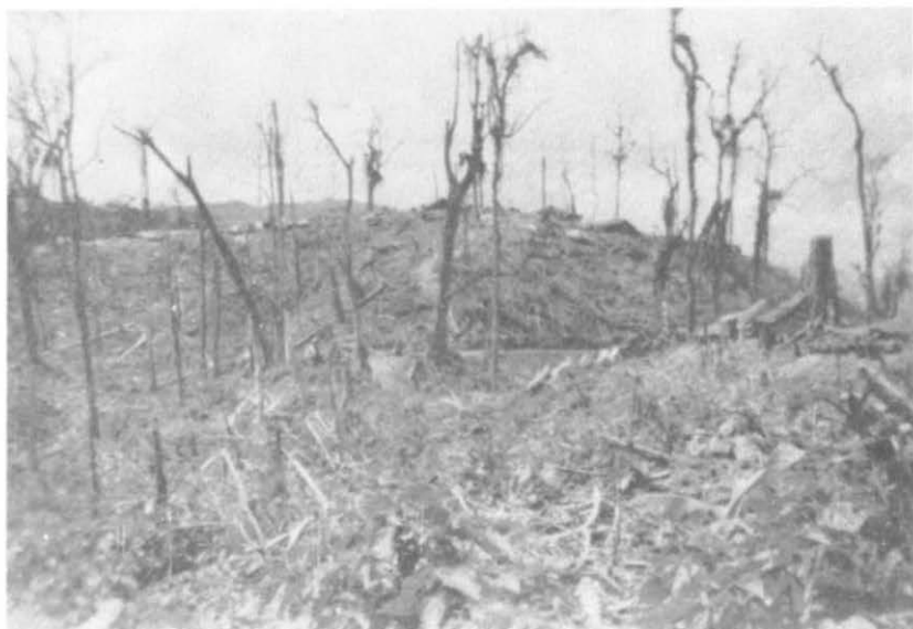
Artillery Hill on Bougainville, so named because of the large number of Artillery strikes called down upon it to dislodge the enemy.