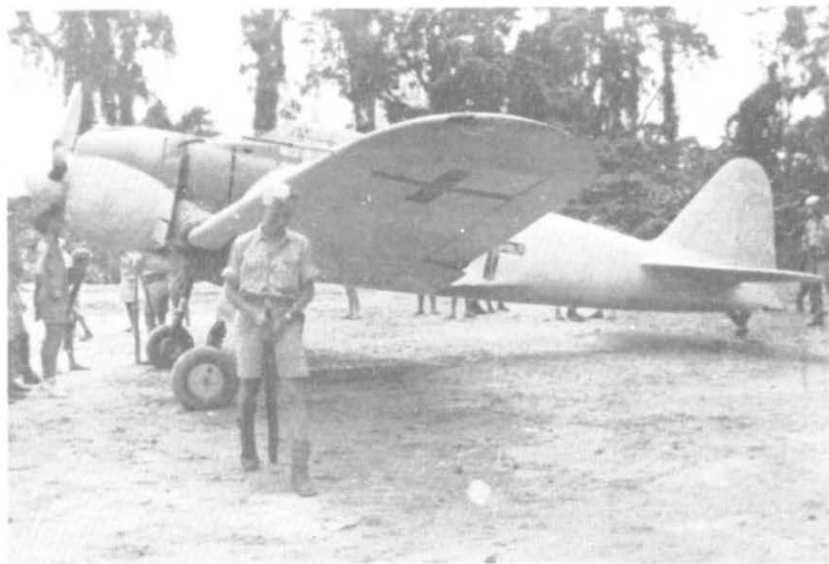
This is a Japanese "Zero", used for dropping surrender leaflets over enemy territory. The leaflets called upon the enemy forces to surrender. This aeroplane was from Buin in the South of Bougainville and was flown to Piva Airstrip at Torokina for the occasion.