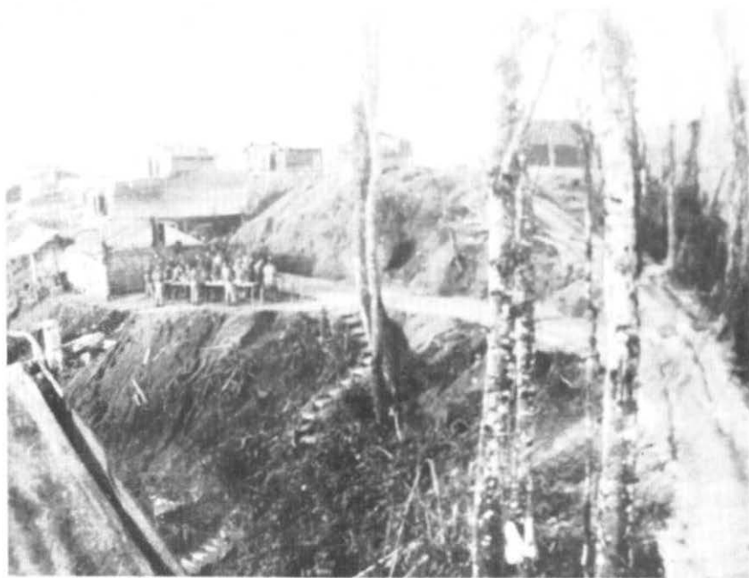
Another feature of the Numa Numa Trail. With constant rain it was at most times, hard to traverse.