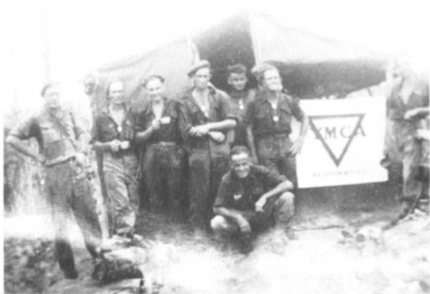
There's always time for a cup of tea and the YMCA or Salvation Army were always there to supply.