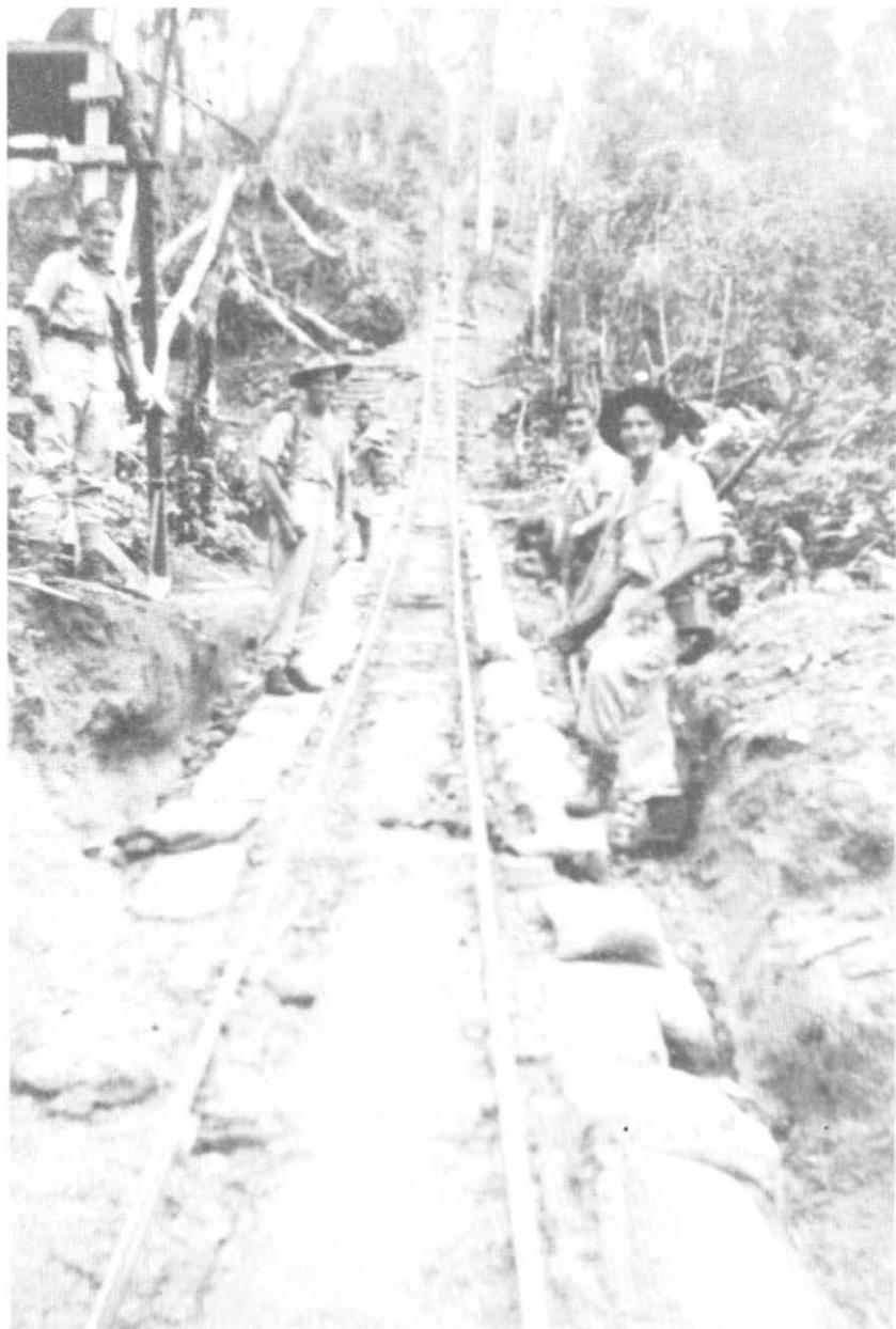
Another view of the fenicular railway up Barges Hill (about halfway). Prior to this masterpiece being built all equipment, ammunition, food and supplies, as well as dismantled motor vehicles, had to be carried up the zig-zag track. Barges Hill was approximately 2000 feet high.