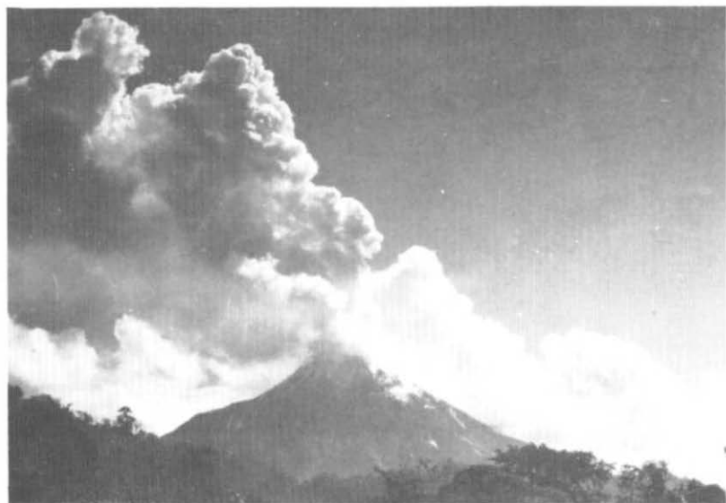
A view of Mt Bagana, a very active volcano which scared the daylights out of nearly everybody when it erupted to greet the 7th Battalion members on Bougainville in April, 1945. It became affectionately known as "Old Smokey" or "Smokey Joe" as it continued to shake the area on a number of occasions.