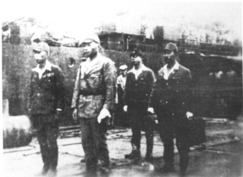
General Kanda and his entourage arrive aboard the HMAS Diamantina, to sign the surrender documents — Bougainville, 1945.