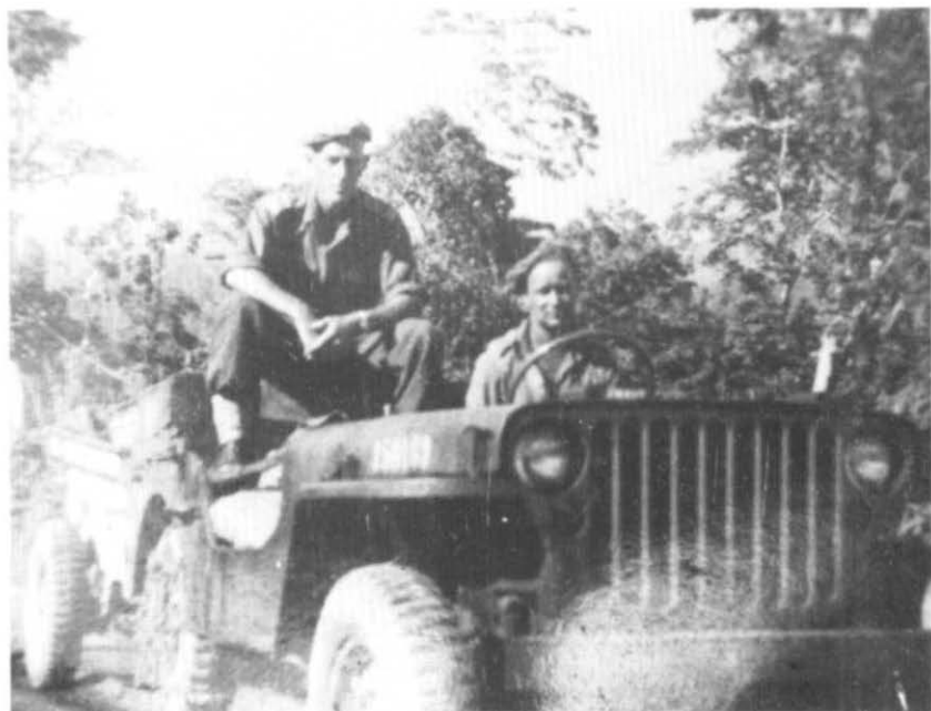
One of the Jeeps with crew. These carried supplies along the Numa Numa Trail, as far as Berry's Hill, one of the vehicles man-handled up Barge's Hill after it had been converted to a "Jeep" track.