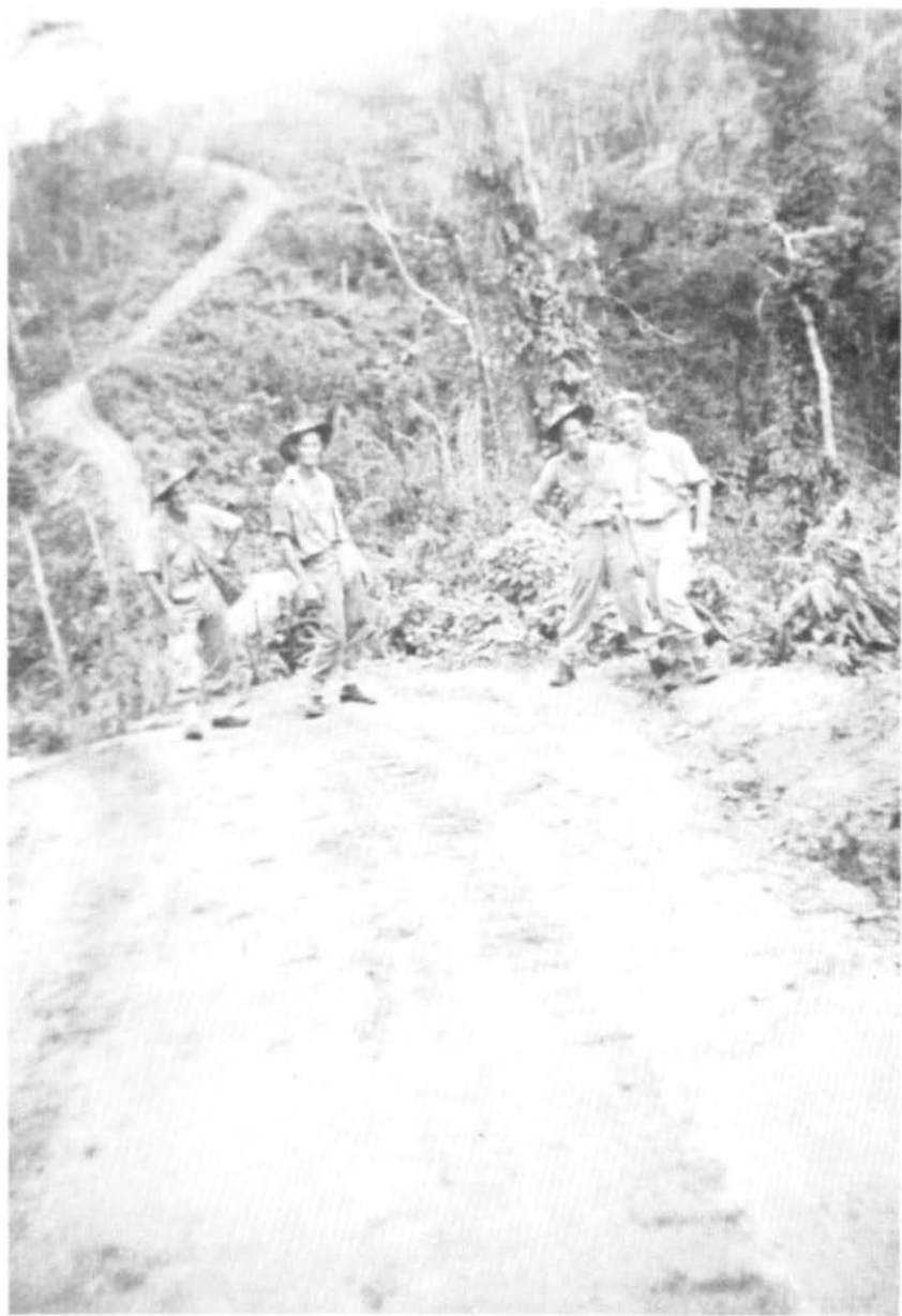
The Numa Numa Trail, which leads across the centre of Bougainville to the East. A jeep track was later constructed all the way from top of Barge's Hill to Berry's Hill, about 5 miles! The vegetation has been literally blasted away by the constant Artillery Mortar and blasting by aircraft on the enemy, as the 7 Bn advanced.