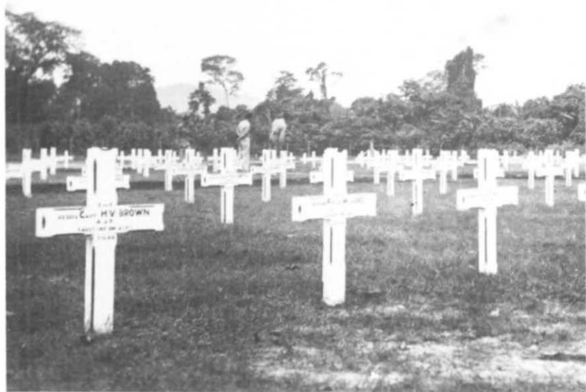
War graves at Torokina, Bougainville. The grave on the left is that of Captain Brown, OC "D" Coy, who was killed in an aeroplane crash in 1944.