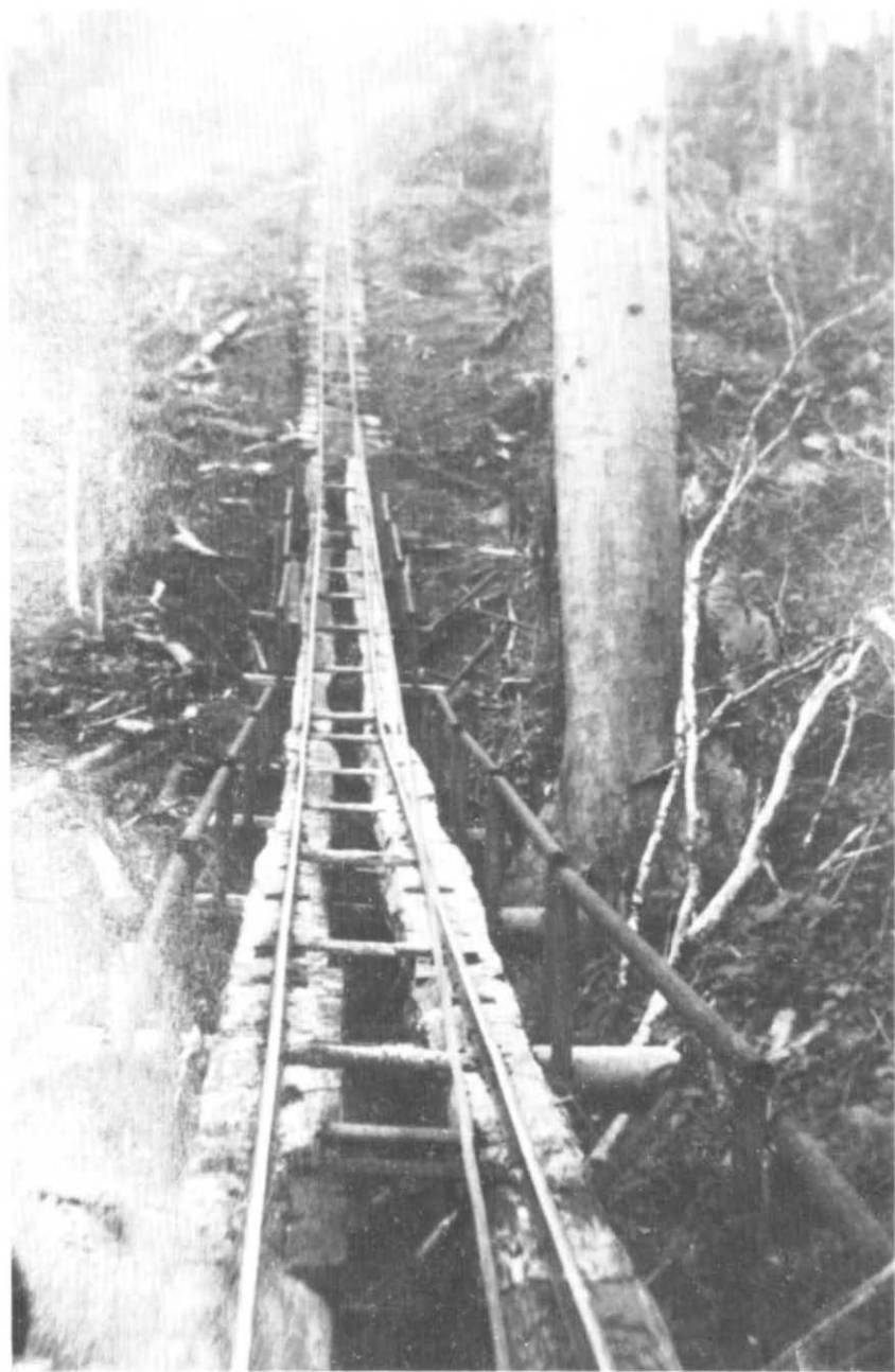
The fenicular railway up Barges Hill, which rose to an approximate height of 2000 feet (600 metres) above the river valley.