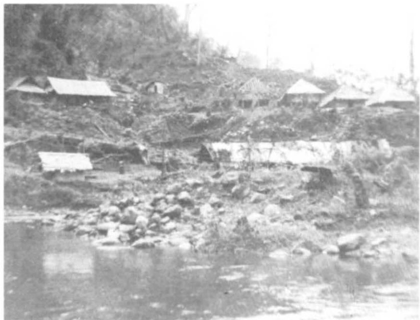
The ANGAU Camp at the bottom of Barges Hill.